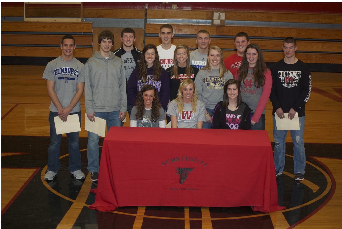
Seniors intending to participate in athletics in college.